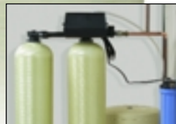
Installing a twin-tank softener featuring the Fleck 9100 valve can save significant amounts of water and salt.