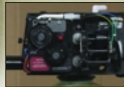
3200 Mechanical Timer