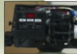
Advanced SE Electronic Timer

daily use. In addition, they offer the added advantage of having only a single moving part in contact with water for low maintenance.